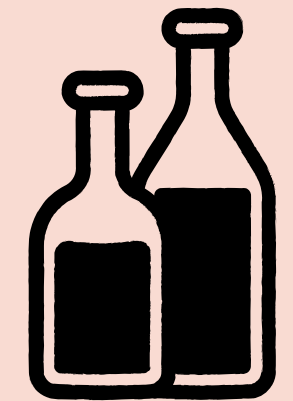
Filling & Packaging